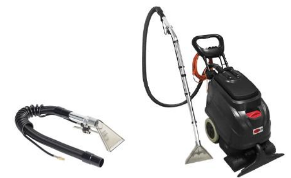
Upholstery hand tool and floor tool as optional accessories