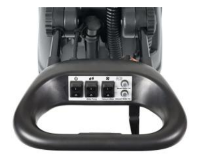
Ergonomic and adjustable handle