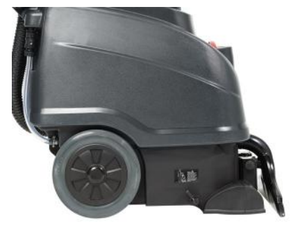
Large wheels for easy transport and maneuverability