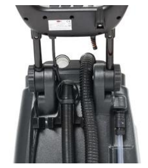
Drain hose for easy emptying