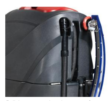
Built in squeegee hanging system for easy transport in narrow areas