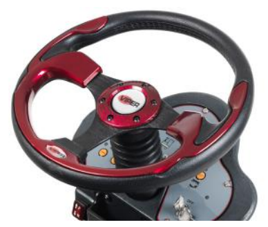
Intuitive dashboard, one touch button and user friendly menu for operation settings