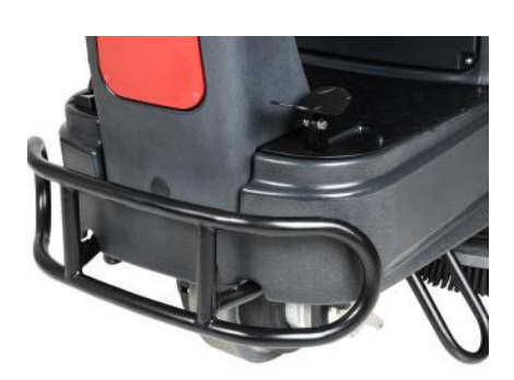
Front bumper protects the machine