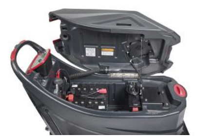
Recovery tank with hand grip for easy tilting