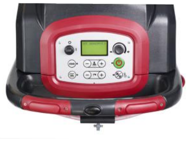
Intuitive control panel with LCD screen for all models (AS6690T/AS7690T pictured)