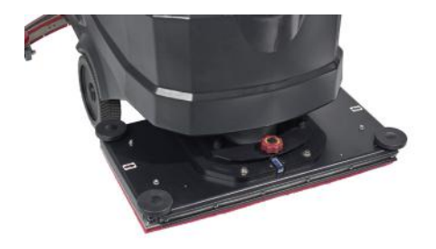
Orbital scrubber for floor cleaning or coat stripping (AS7190TO)